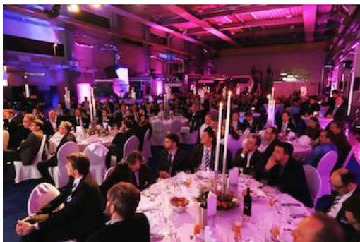
Opening event the evening before EREMA Discovery Day 2015