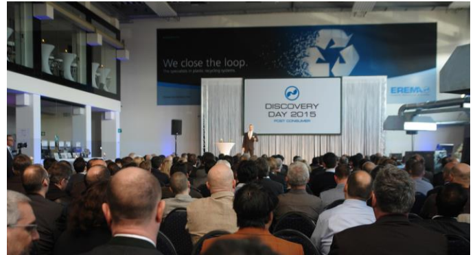
EREMA Discovery Day 2015: Post Consumer Recycling

Another event in the successful EREMA Discovery Day series took place at the EREMA headquarters in Ansfelden, Austria on 20 March 2015. Over 200 existing and potential customers and other guests accepted the invitation and this time took full advantage of information about trends, challenges, opportunities and efficient solutions in the field of post consumer recycling. The highlight of Discovery Day 2015 was the global premiere of the new product innovation INTAREMA ® Re grindPro ® for the highly efficient recycling of regrind materials.