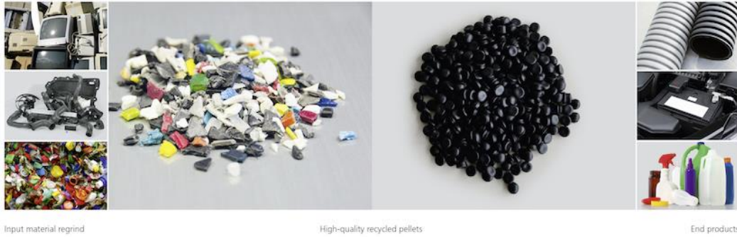
The new INTAREMA® RegrindPro® technology

The result of the new INTAREMA® RegrindPro® recycling technology for regrind is maximum pellet quality for a maximum amount of recyclate in the new end product.