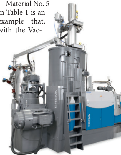
Fig. 3. For IV-stable processing of the melt from bottle flake, the Vacurema has over twice the volume of the former standard and is designed for a vacuum down to 10 mbar

Material No. 5 in Table 1 is an example that, with the Vac-