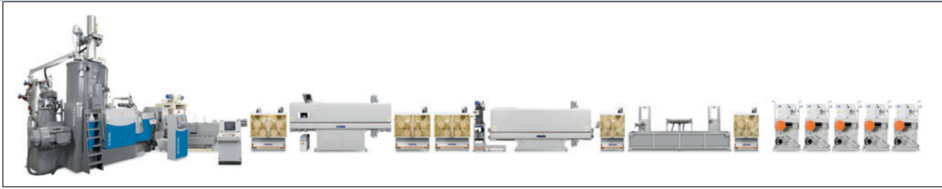
Fig. 2. The plant concept for inline processing of PET bottle flake into high tensile strength PET strapping consists of a Vacurema Strapping 1308 TE and a directly coupled Tight Strap 300 stretching line with up to 130 m/min take-off speed and a throughput of 300 kg/h

strength PET strapping in a single operation without further additives or treatment. In conventional strapping extrusion lines with a preliminary dryer, the PET flakes had to be augmented with a significant proportion (roughly a third) of PET virgin material to compensate for the material degradation taking place during extrusion (which reduces the intrinsic viscosity IV) (cf. e.g. [2]). The new Vacurema technology can therefore significantly reduce raw materials and manufacturing costs by using 100 % bottle flake as starting material.