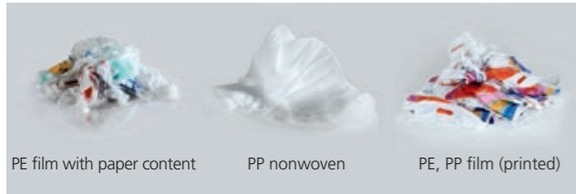
Examples of raw recycling materials

EREMA melt filter: fully automatic and self-cleaning