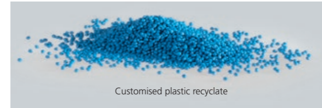
Customised plastic recyclate