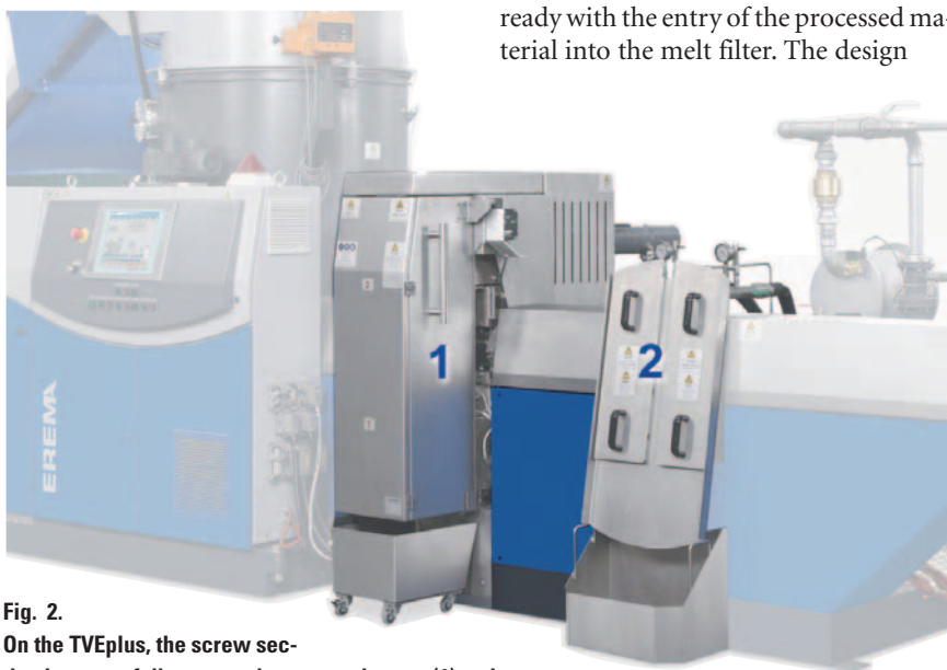
Fig. 2. On the TVEplus, the screw section between fully automatic screen changer (1) and degassing station (2) serves for intensive melt homogenization

In order to exclude faults caused by uncontrollable and yet fluctuating foreign contamination, clean production waste of a full-surface printed and even multi-layer printed PE-LD film was used for the comparative investigations (Fig. 3). A pragmatic, comparatively easily determined criterion was selected for the assessment of the re-granulate quality obtained: The