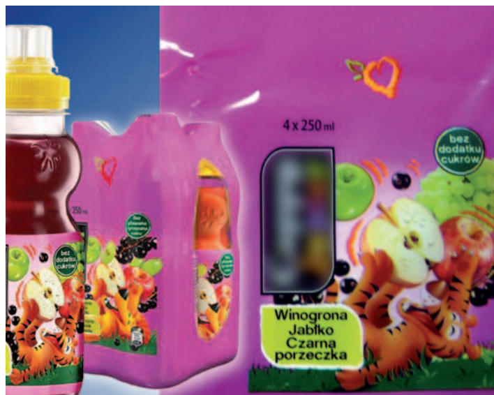
Fig. 3. This intensively and fully printed PE-LD shrink film was used for the comparative investigations with the recycling lines Erema TE, Erema TVE and Erema TVEplus with different screw configurations

Figure 4: In the test configuration TVE with triple degassing. For this the extruder barrel had two degassing positions downstream of the filter: A single vent had been additionally positioned upstream of the double vent installed in the normal configuration. Screw geometry and distance between the two degassing points had been selected such that a screw section completely filled with melt separated the two degassing points from one another.